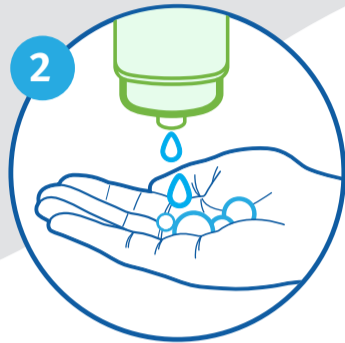
Apply enough soap to cover all hand surfaces.