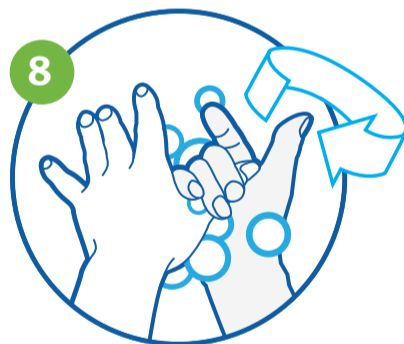
Clean thumb by holding it in the other hand and rotating.