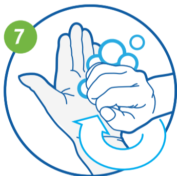
In a circular motion rub the tips of fingers in the palm of the opposite hand.