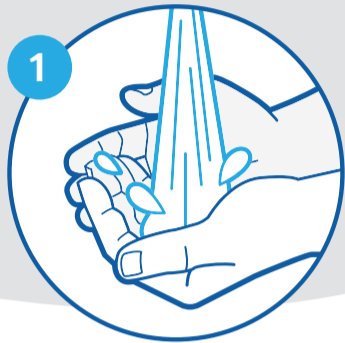
Wet hands with water.