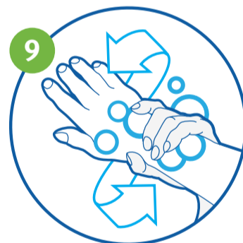
Rub wrist with the opposite hand.