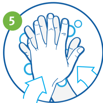
Rub hands palm to palm with fingers interlaced.