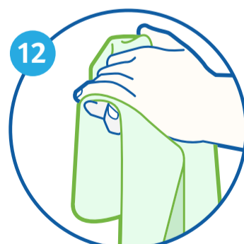
Dry hands with clean paper towel and use paper towel to turn off tap.

Researchers think that if everyone washed their hands properly, about 1 million lives would be saved every year. 1