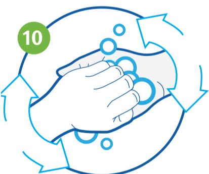
Interlock fingers and rub back of fingers on opposite palms.